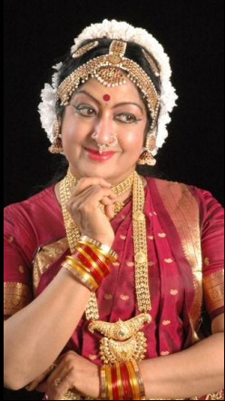
Dr. Padma Subrahmanyam